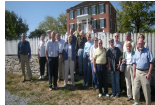
Museum members on special tour of Antietam Battlefield, 2010

Sandy Spring has provided centuries of innovative leadership to Montgomery County and Maryland, in education, social justice, agriculture, transportation, and technology. Museum exhibits and programs explore the meaning of this legacy for Montgomery County today.